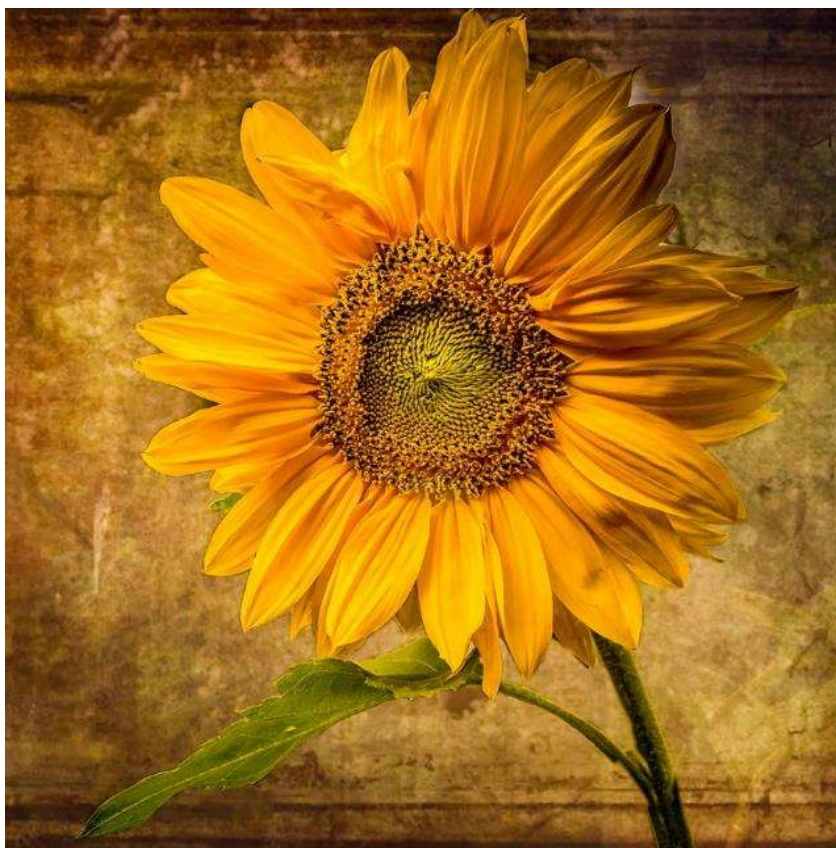
"Sunflower" author: Scottish