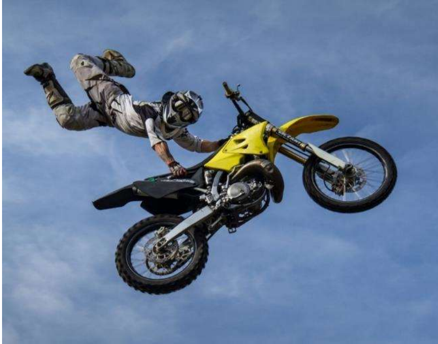
"Hanging on overhead"