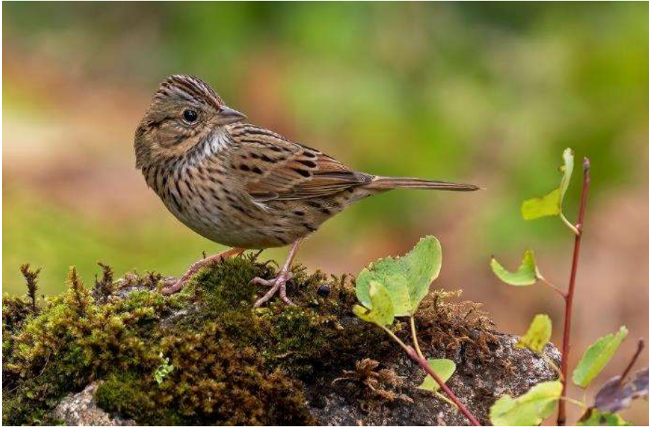
"Lincoln sparrow on the lookout"