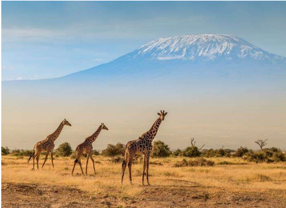
"Giraffes at Mt Kilimanjaro"