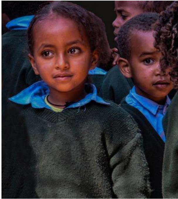
"Eyes of a child"