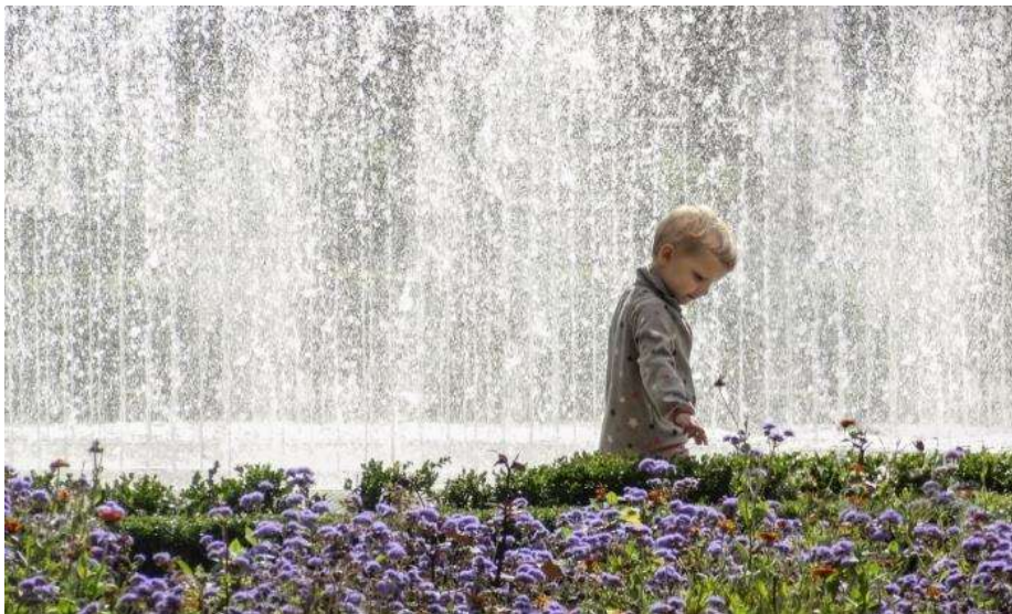
"Taking time to enjoy the flowers"