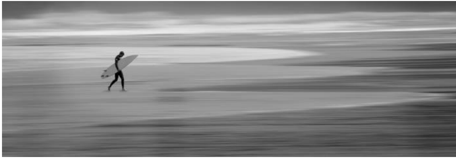
"A good day" author: Scottish