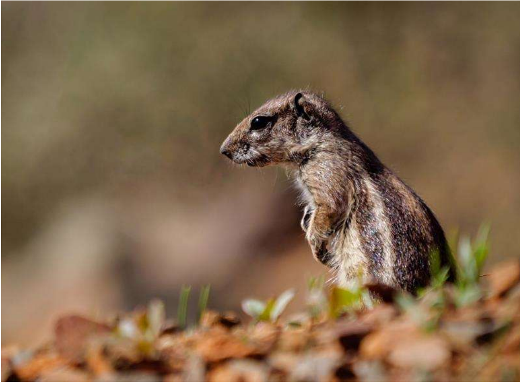
"The sentinel" author: Scottish