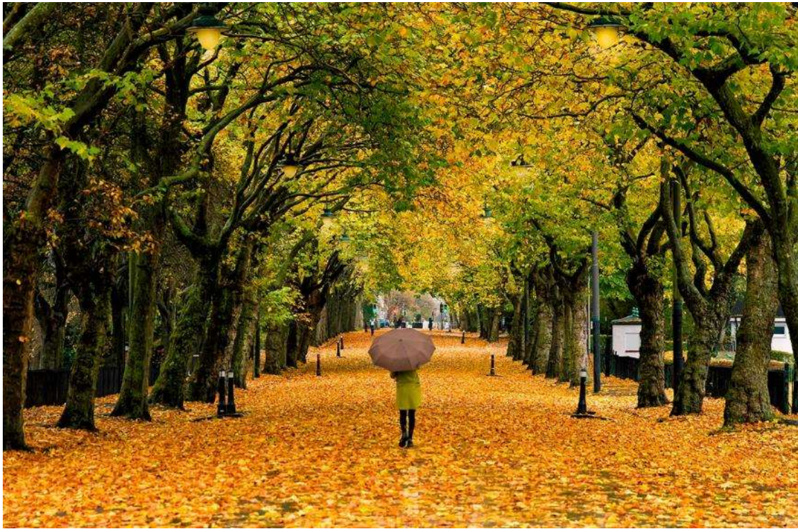
"Yellow leaf road"