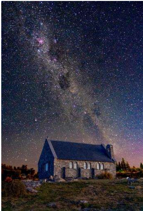
"Milky way over the church of the good shepherd"