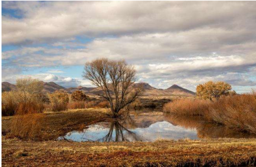
"Bosque del apache" author: Kahsia Hartwell

Canadian Judge Every element in this image is well handled. DOF, composition, rule of odds, excellent light, right time of day