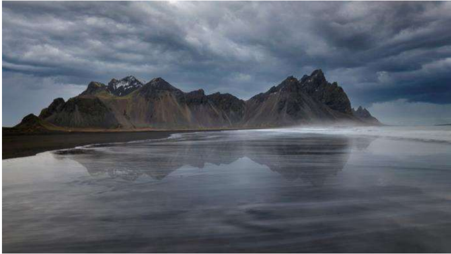
"Somewhere in Iceland"