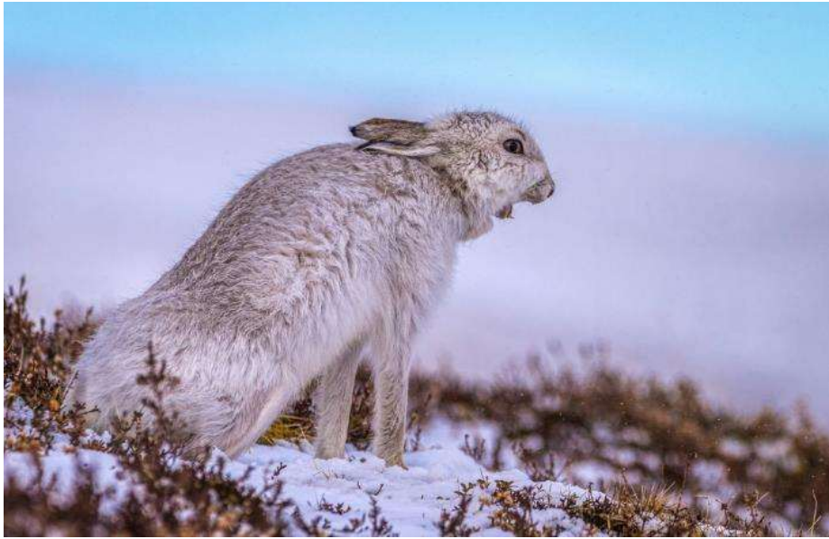
"Mountain hare yawning" author: Scottish