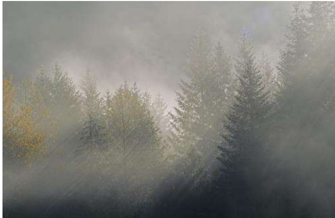
"Early morning fog"